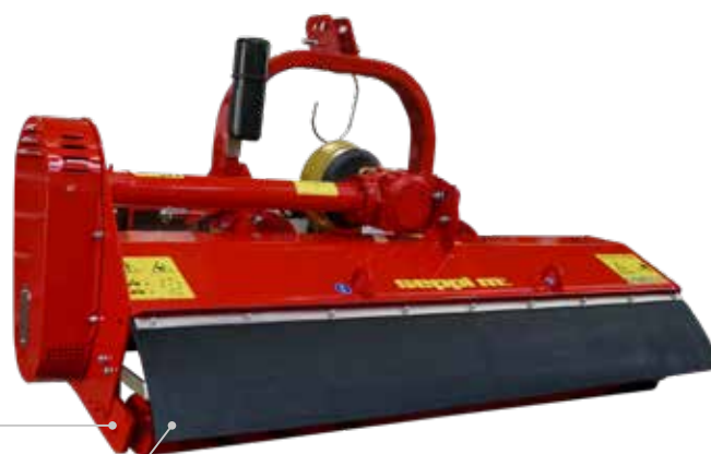
Height-adjustable support roller